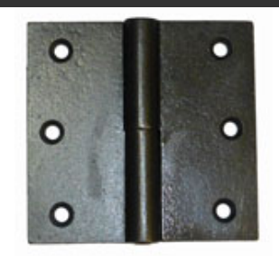
Traditional cast iron hinge for doors

John Wright combines modern manufacturing with the strength and traditional look and feel of cast iron. The barrel hinge provides a period-authentic architectural alternative to formed steel hinges. Whether in restoration or traditional new construction, its solid cast iron construction provides an old-time look and feel.